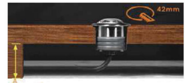
A: Minimum space for external driver is 48mm