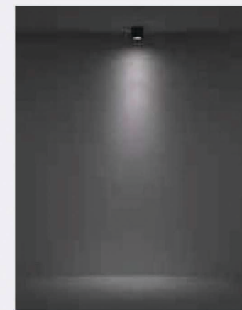
Beam Effect demo