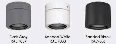
Dark Grey RAL 7037