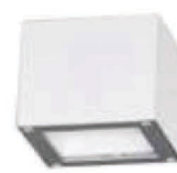
Sanded White RAL 9003