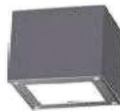
Dark Grey RAL 7037