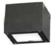
Sanded Black RAL9005