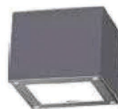
Dark Grey RAL 7037