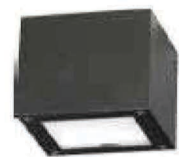
Sanded Black RAL9005