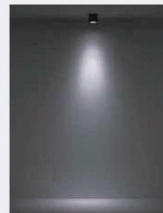
Beam Effect Demo