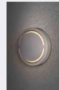
Recessed mounted by 140# sleeve