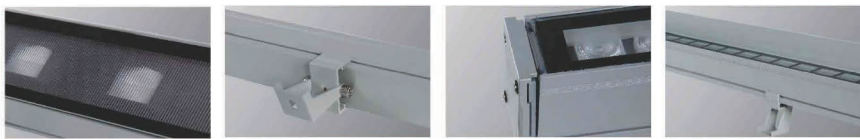
Rectangle Glass (Optional)